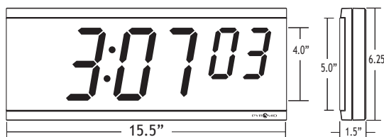
DIG-6B 4" x 6 Digit Series

DIG-6B (4" x 6 Digit Series) with optional count up/down controller