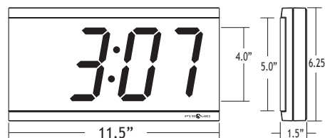
DIG-4B 4" x 4 Digit Series