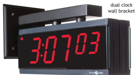
Part# 42320 for 4x6 digital clock