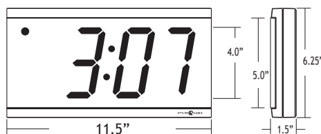
4" x 4 Digit Series