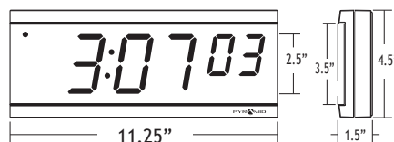
2.5" x 6 Digit Series