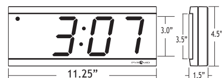
3" x 4 Digit Series