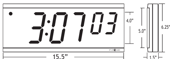
4" x 6 Digit Series